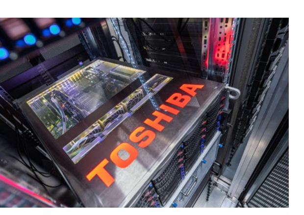
Server and Storage in the Technology Experience Lab