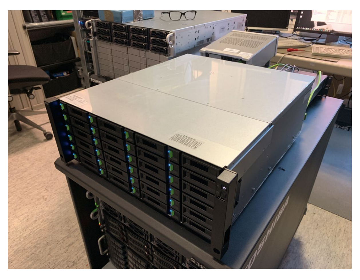
Figure 1: The QSAN XS3324D

The model provided for testing was QSAN's XS3324D, a 4U/24-bay front loading fully-integrated storage area network (SAN) block-storage solution with dual/redundant SAS controller and power supply (as described in Figure 1). It operates as block storage for dedicated SANs. This is support over iSCSI, fibre channel (with optional FC modules – not tested), or both. Due to its dual-controller architecture, providing a dual-path from network down to HDD access, it is best suited to high-capacity, SAS Nearline HDDs. It features a number of field replaceable units (FRU) that can be hot-swapped in the unlikely event of component failure.