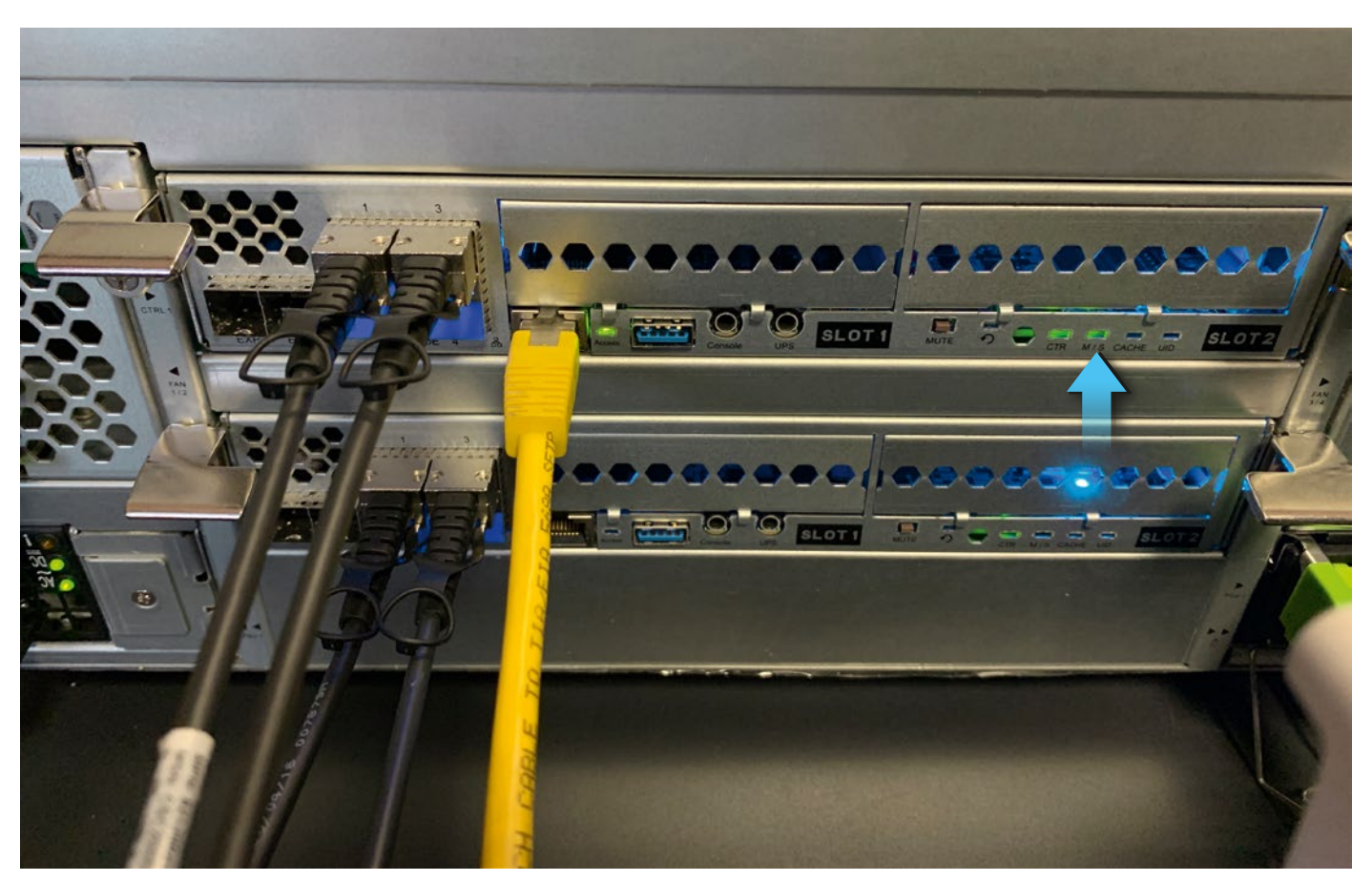
Figure 3: XS3324D Network Connections