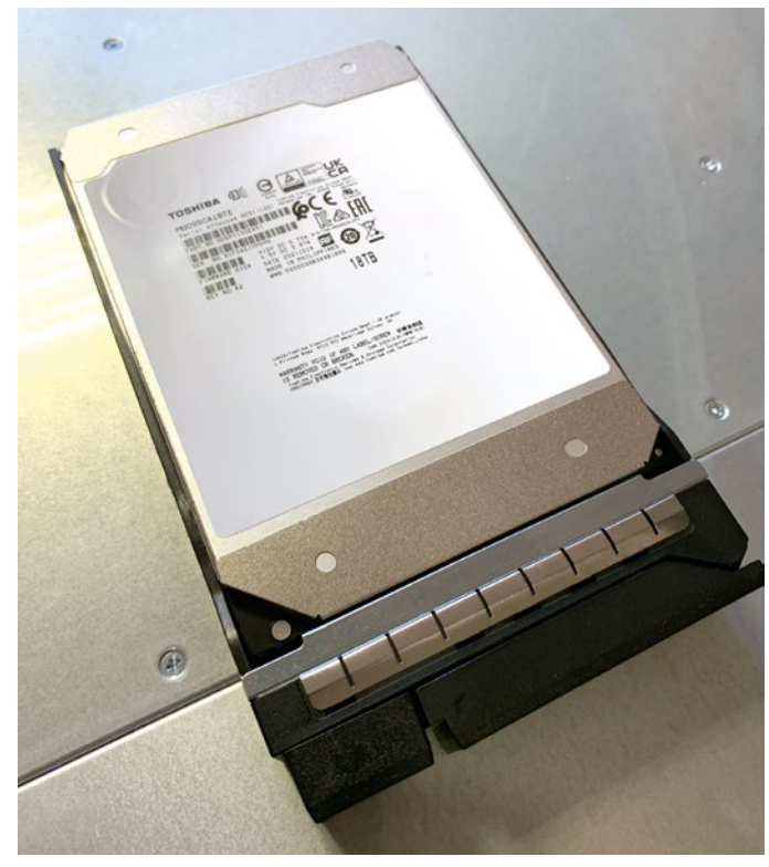
Figure 2: Toshiba MG09SCA18TE Enterprise SAS HDD

For reference: The model version tested was XS3324D, with Firmware Version 2.2.1.