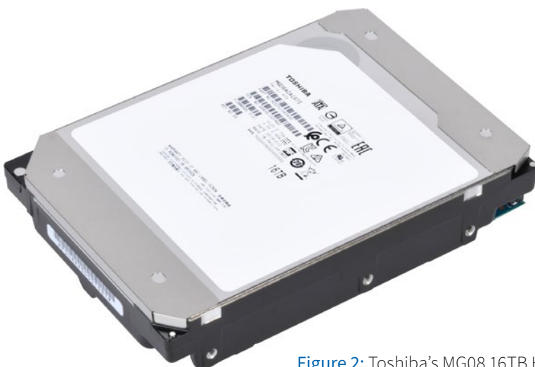
Figure 2: Toshiba's MG08 16TB HDD

The corresponding 16TB HDDs of Toshiba's MG08 series are available with SAS or SATA interfaces. The SAS interface has two 12GB/s channels, making it suitable for architectures where speed and, above all, high availability are important. This comes at the expense of power dissipation (SAS HDDs consume roughly 1-2W more power than SATA HDDs, due to the higher power consumption of the interface). Since one goal was to optimise for power dissipation, the MG08ACA16TE model with SATA interface was chosen.