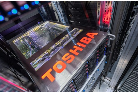
Server and Storage in the Technology Experience Lab