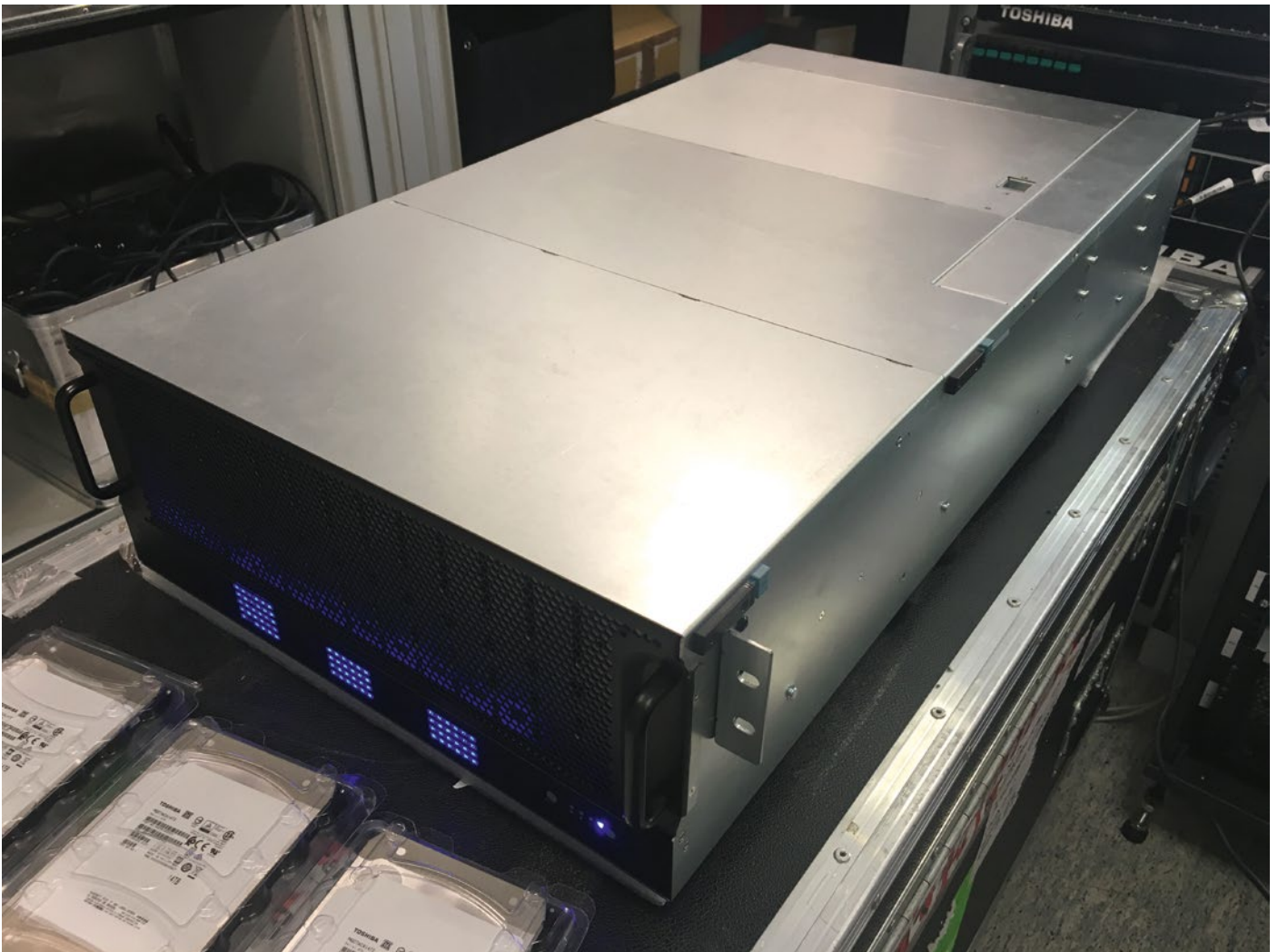
Picture 1: J4078-01 in Toshiba Lab We tested this model with the latest 16 TB HDDs in the Toshiba Lab.

for more than 60 drives are very long (sometimes more than 1 meter) and unable to fit into existing racks. The AIC JBOD Model J4078-01 is only 810 mm long and, while offering 78 slots, it's one of the shortest models in this class and fits into any existing rack.