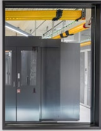
Technology Experience Lab in Frankfurt