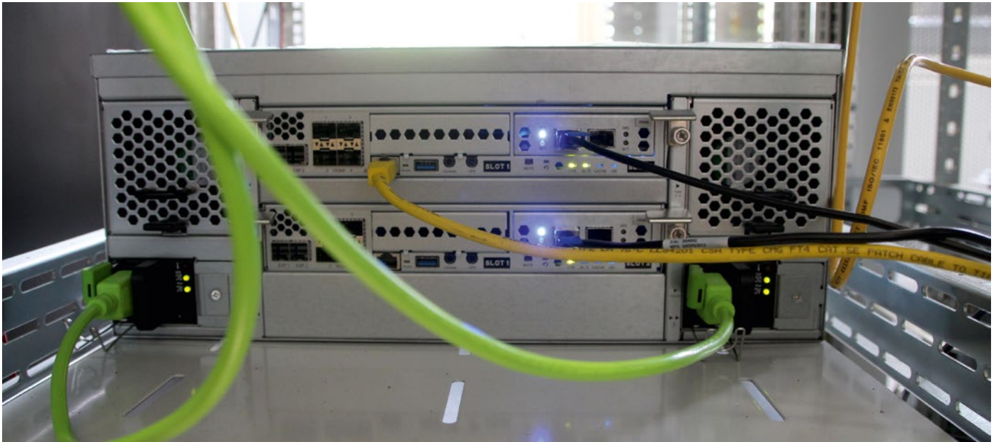
Figure 2: XN5124D Network Connections