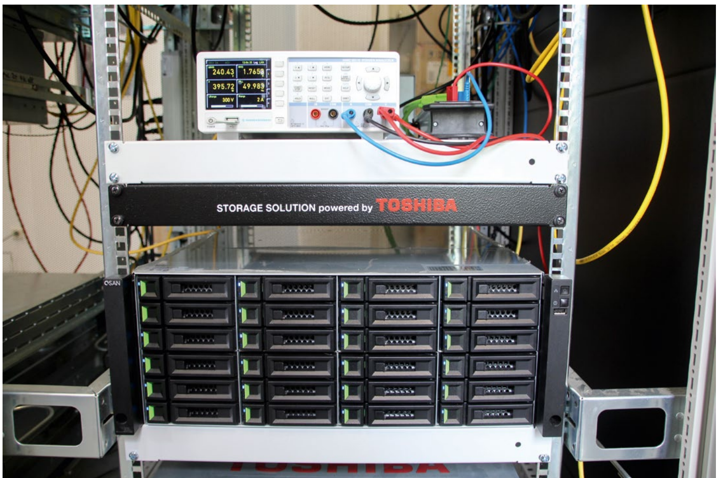
Figure 1: The QSAN XCubeNXT XN5124D in Toshiba’s HDD Lab

age (NAS) providing shared folders/file system or as block storage for dedicated storage area networks (SAN) like iSCSI, Fibre Channel, or even both in parallel. QSAN promotes it as “the newest generation of XCubeNXT that harnesses industry-leading versatility for mixed workloads.” Additionally, the highly available and secure multiple protocol and cross QSAN platform support is claimed as being the best Total Cost of Ownership (TCO) for capacity demanding applications.